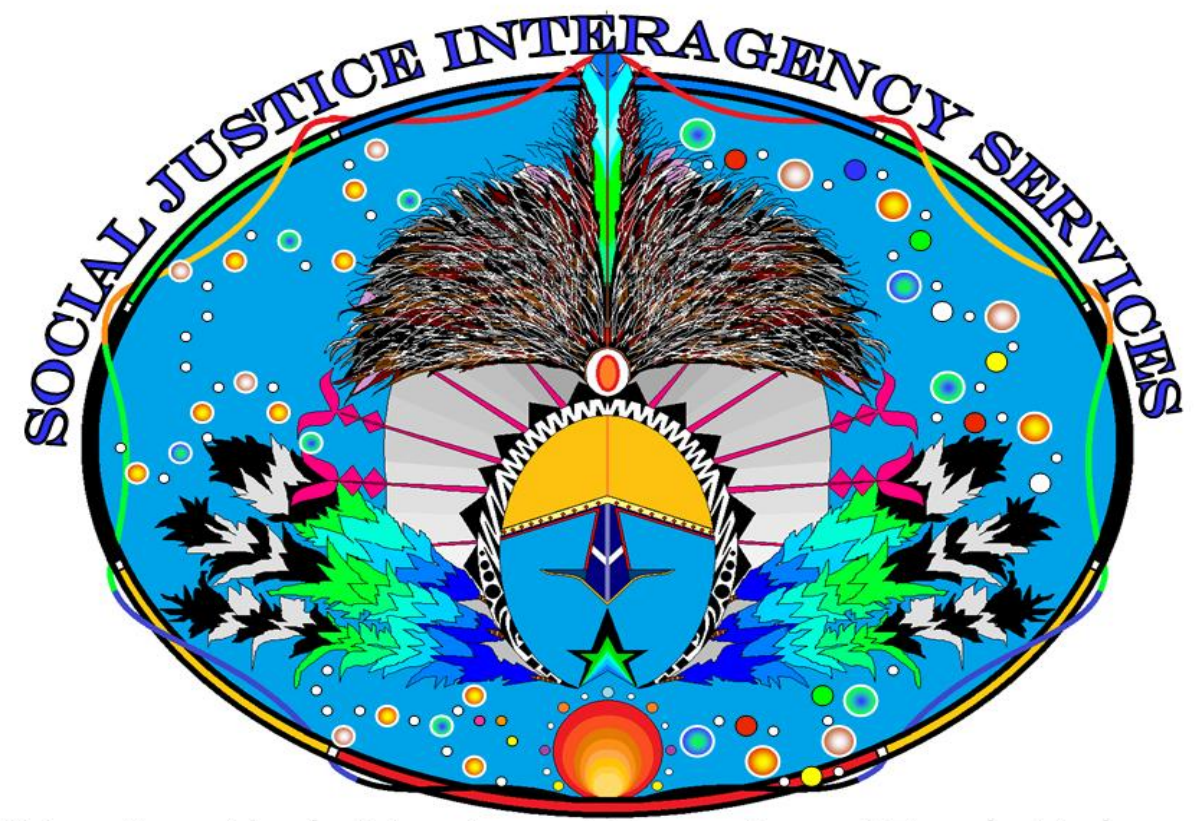
"Umi One, Mepla Way Against Domestic and Family Violence"