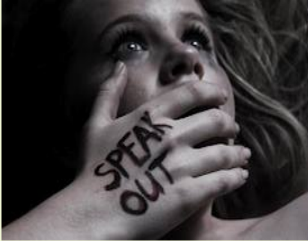
1. Reporting IPV