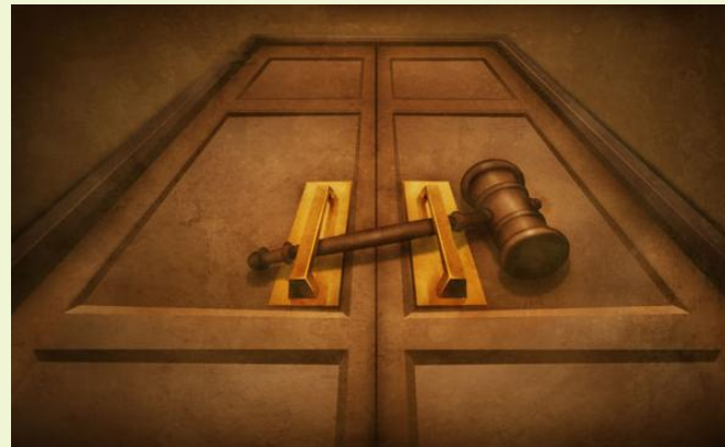
3. Barriers accessing CJS