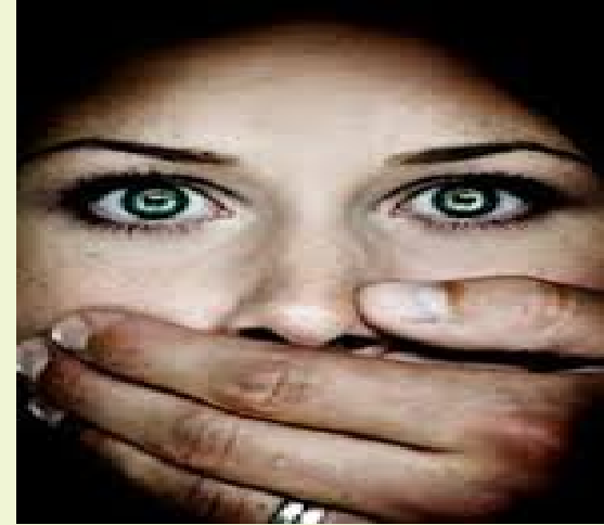
2. Not reporting IPV